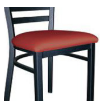
Chair Seat Pads