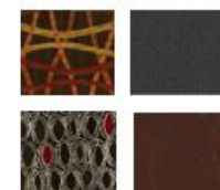
Vinyl by the Yard